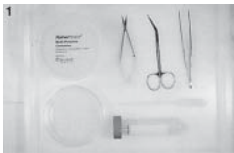
Fig. 1. Materials and instruments used for epithelial cell isolation. Moving clockwise from top left corner: surgical cutting board, small plastic container, surgical scissors, forceps, plastic transfer pipet, 50 mL centrifuge tube, and a Petri dish.