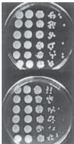
Fig. 1. Growth on YPD obtained from different sources. Several deletion mutant yeast strains are spotted at four increasing dilutions on YPD plates made from ingredients obtained from different sources (top plate vs bottom plate). Photograph is taken after 2 d of growth at 30°C.

of several mutant yeast strains grown on YPD obtained from different sources (top plate vs bottom plate). The slower growth rate observed at the highest dilution (bottom plate far right vs top plate) is an indication that not all YPD rich media are equivalent.