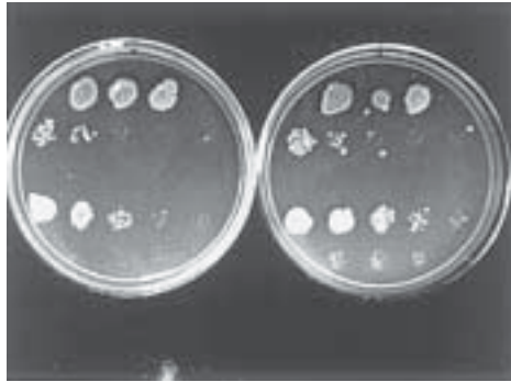
Fig. 3. Growth on sterile, filtered vs autoclaved SD dropout plates. Two randomly selected His + and LacZ + yeast clones from a two-hybrid screen (top half and bottom half of either plate) are plated at increasing dilutions on SD–trp–leu–his + 2 mM 3-AT prepared by autoclaving (left plate) and sterile filtration (right plate). The yeast reporter strain used is CG1945. Photograph is taken after 3 d of growth at 30°C.