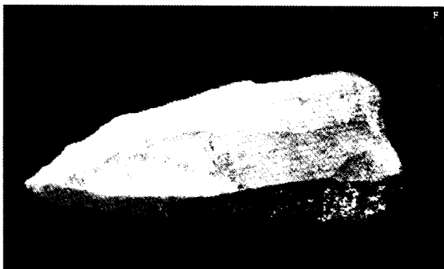
Figure 1 Stone “needle” with bilateral blade, pointed end, 7×3 cm, used in the Paleolithic age for blood and pus letting, unearthed at Henan province. From Fu Weikang, A General History of Chinese Medicine , Vol. IV: Illustration Album . Used with the permission of the publisher.