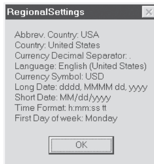
Figure 1-1. Regional Settings—United States

This code produces the message box depicted in Figure 1-1.