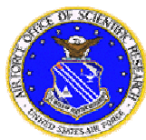
Air Force Office of Scientific Research