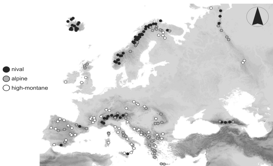
Fig. 1.1. Elevational characterisation of Europe's high mountains

Boreal and arctic alpine environments receive moderate snow in winter and are characterised by severe frosts. In the summer, long days result in an extended light period that may selectively favour certain adapted plant species. The tree line in the European boreal mountains, in contrast to the conifer forest of the mountains of continental Siberia, is formed by birch ( Betula pubescens spp. czerepanovii ). Mixed dwarf-shrub heath with dwarf birch ( Betula nana ) and shrubby willows cover large areas within the tree-line ecotone. Above this, ericaceous dwarf-shrub heath ( Vaccinium spp., Empetrum hermaphroditum ) appears, replaced at higher elevations by fell-fields with small cushion plants and creeping dwarf shrubs (e.g. Diapensia lapponica , Loiseleuria procumbens ), sedges (e.g. Carex bigelowii ) and rushes