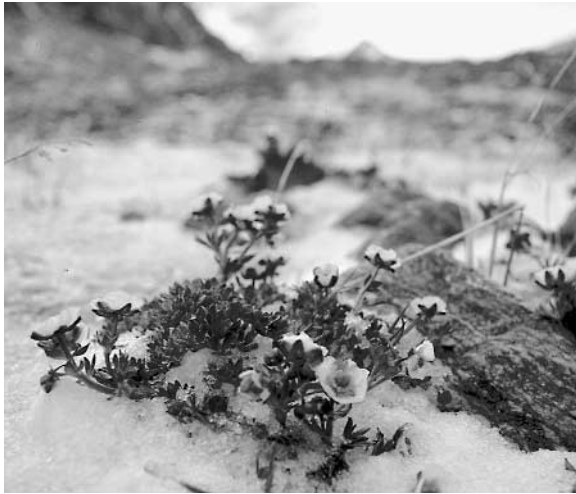
Fig. 1.1. Fit to survive and reproduce under demanding environmental conditions ( Ranunculus glacialis , Alps 2600 m)

(stress) may stimulate (in the short term) growth and reproduction, but in the long term, may eliminate an organism from its previously more “limiting” habitat by competitive replacement. Environments are only limiting to those which are not fit.