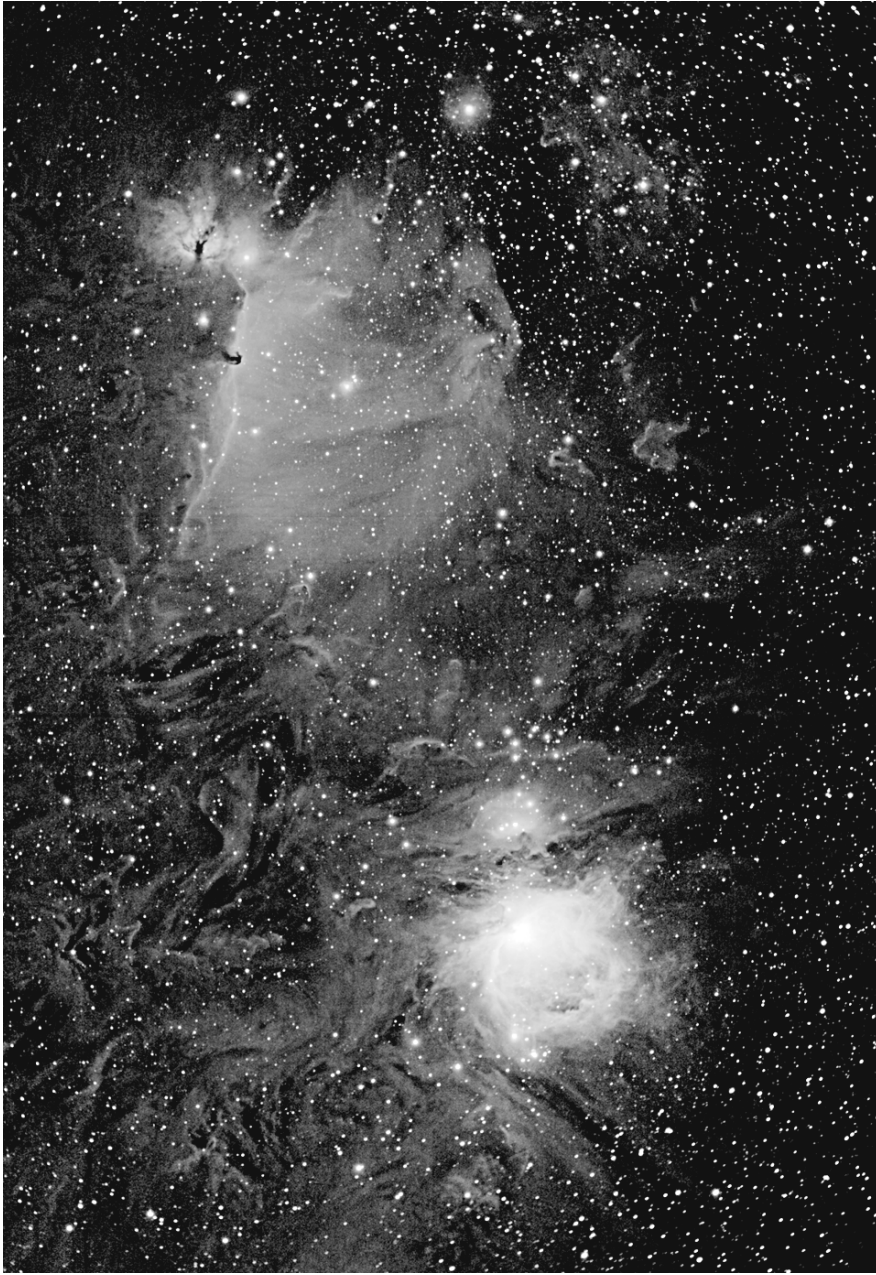
Fig. 1.1. Turbulent ionized plasmas filling a nearby region of space around the active star-forming region of the Orion Nebula.