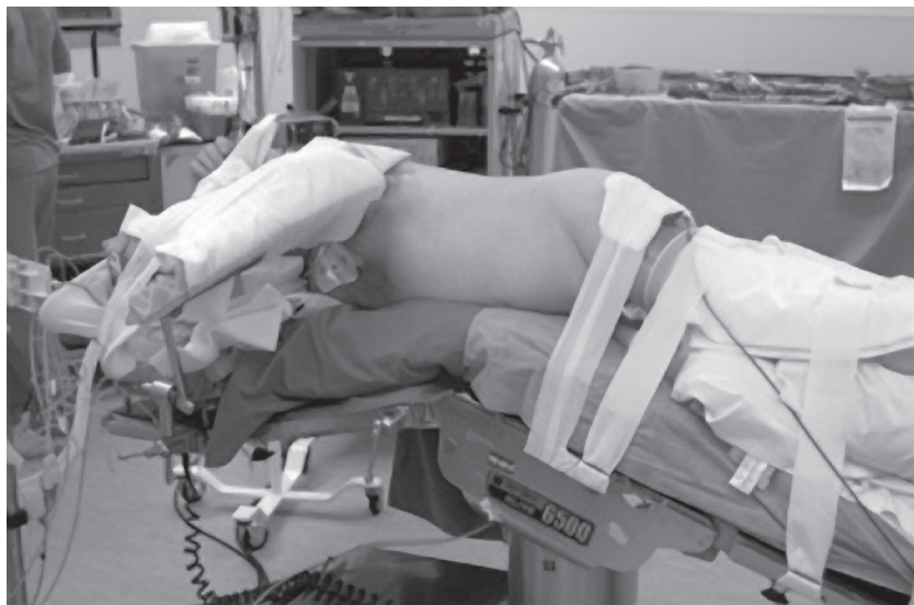
Fig. 1. Patient positioning for cytoreductive laparoscopic radical nephrectomy. Patient is in the flank position with the table flexed and adequate padding of all pressure points.

careful attention. Once the hilum is fully dissected, the artery is ligated using clips or an endovascular-stapling device. Inspection of the renal vein is mandatory to ensure it has collapsed. An instrument can be passed behind the vein to tent it up to ensure the absence of a tumor thrombus or additional arteries. Doppler ultrasound performed using a laparoscopic probe is required if there is any question of tumor thrombus or multiple arteries. The vein is secured using an endovascular stapler.