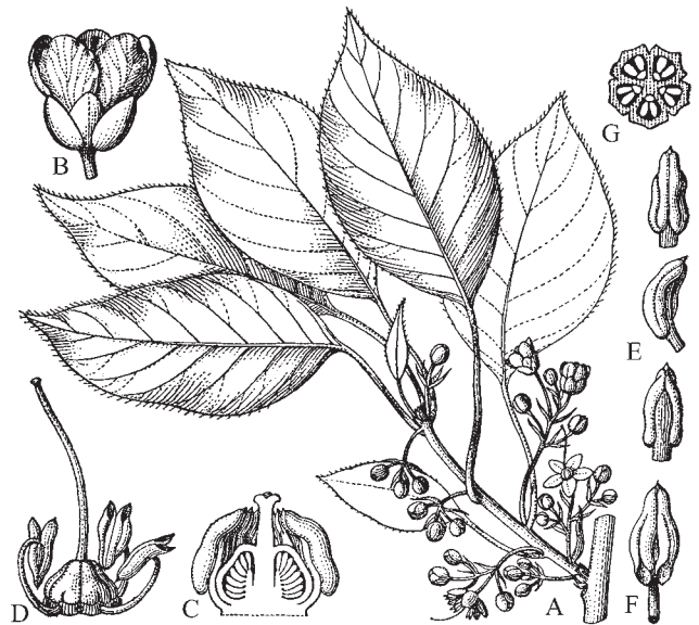
Fig. 4. Actinidiaceae. Clematoclethra lasioclada . A Flowering twig. B Flower. C Androecium and gynoecium of young flower, longitudinal section. D Androecium and gynoecium at anthesis, note inversion of anthers. E Young anthers. F Mature anther. G Ovary in cross section. (Gilg and Werdermann 1925)