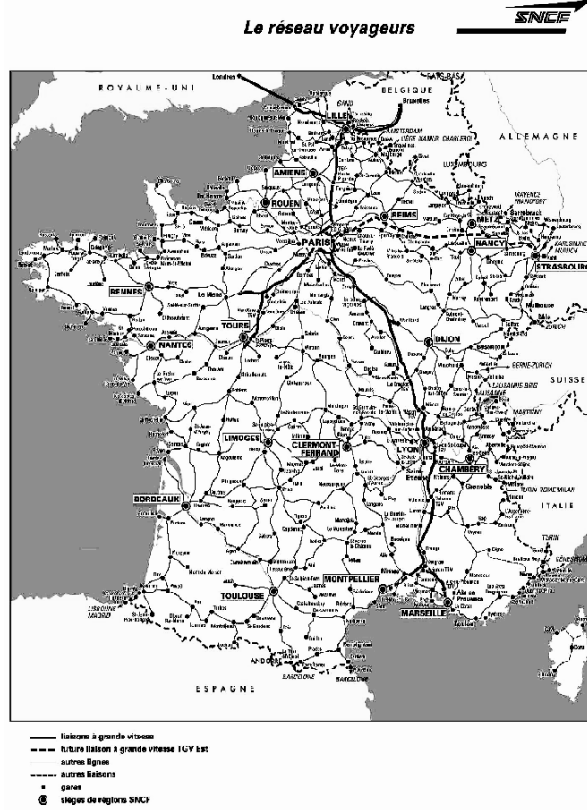
Fig. 2.1: Map of the French railroad network

This motivates the name French railroad metric for the following construction. Let (X, d) be a metric space (“France”), and fix p \in X (“Paris”). Define a new metric d_p on X by letting