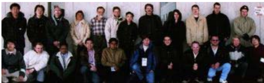
FOGA 2005 Participants