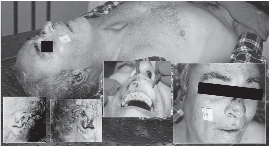
Fig. 2. Homicide without lethal injuries: minor traumatic wounds of the face, inner lips, and tears of the ears caused by the aggressor's bite. Death was attributed to sympathetic-adrenal stimulation on a victim with clinical favorable antecedents such as chronic ischemic disease.

the events surrounding the victim, and document the investigation cautiously to produce the final verdict.