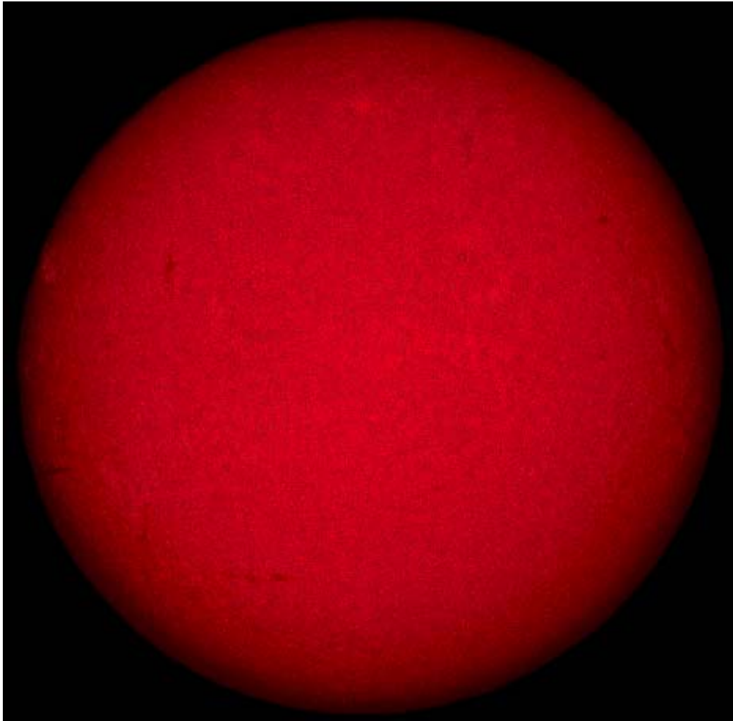
Figure P-1 Sun through a hydrogen alpha PST.

I've actually been amazed myself what it is possible to do with even a limited budget. Just as enterprising amateurs have taken some great photos of the night sky objects, so many have turned their attention to the Sun. The ability to buy and use expensive telescopes and photographic equipment is an advantage but nice photographs can be obtained with modest equipment, as Figures P-1 and P-2 show below.