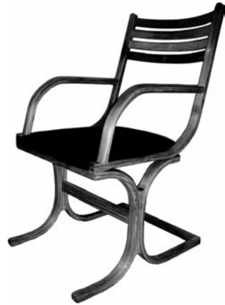
Fig. 2.4 Modern bamboo chair