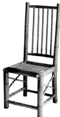
Fig. 2.2 Culture bamboo chair