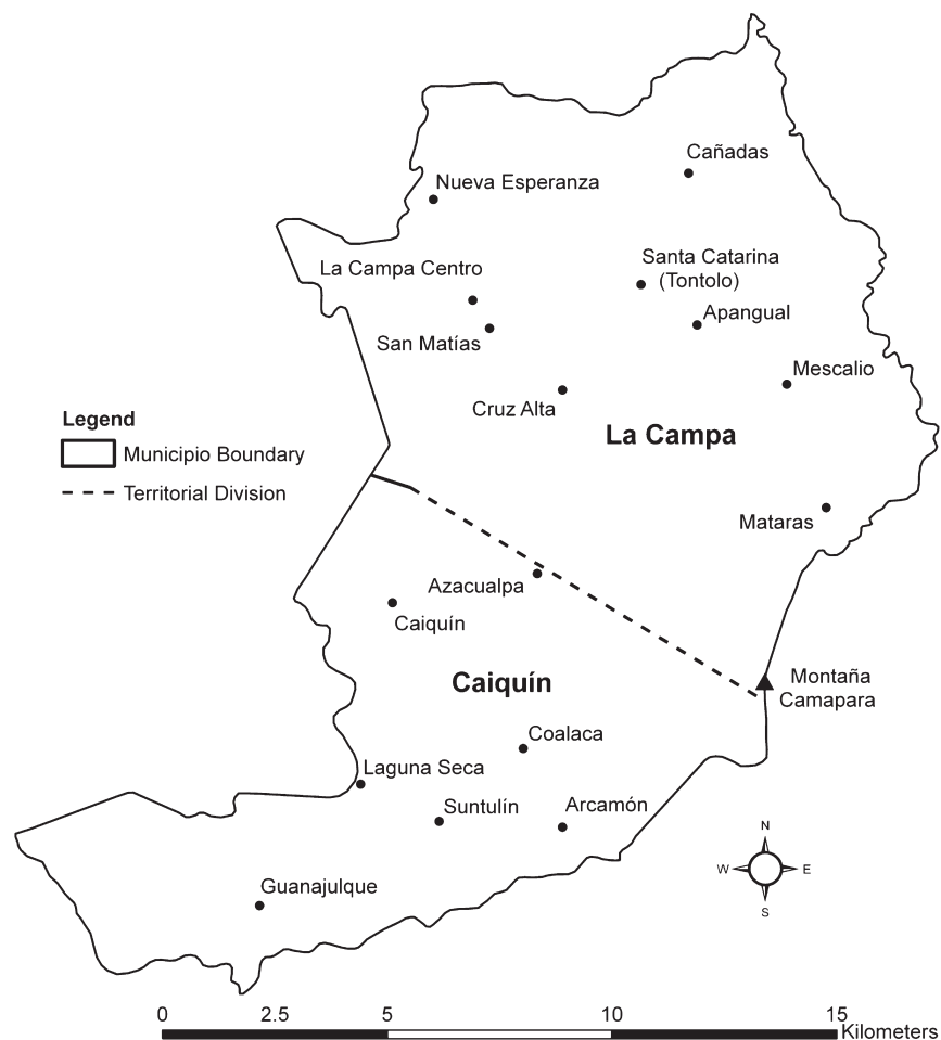
Fig. 2.2 Municipal borders of La Campa, 1921–1995

advanced favorably. When it became obvious that La Campa would succeed in its bid, the people of Caiquín sent their auxiliary alcalde to La Campa with an offer: they wanted to be part of the new municipio as long as La Campa recognized Caiquín's separate land titles and autonomy in land-use decisions. Despite their history of discord, both communities recognized that they had something to gain by unification. La Campa would become one of the department's larger municipios and obtain proportionally more financial support from the national government. It would also have a larger population base to carry out municipal projects (see Fig. 2.2). Caiquín would be free of servitude to Gracias; as part of La Campa it could participate more directly in municipal government and place its own residents on the council. La Campa accepted Caiquín's proposal. When municipal