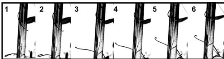
Fig. 1 Adaptive response of morphogenesis in a tendril of Vicia faba . In response to the mechanical stimulus, upon contact with the support, cell elongation becomes arrested in the flank facing the support, whereas it continues at the opposite flank. The resulting growth differential causes a bending response towards the support and will, eventually, result in spiral growth of the tendril around the support. The time-course of the figure covers 24 h

Mechanical load shapes plant architecture, reaching down to the cellular level. Plant cells are endowed with a rigid cell wall and this affects plant development very specifically and fundamentally. The morphogenetic plasticity of a plant is therefore mirrored by a plastic response of both cell division and cell expansion with respect to axially. In this response, cell division has to be placed upstream of cell expansion because it defines the original axis of a cell and thus the framework in which expansion can proceed. The deposition of the new cell plate determines the patterns of mechanical strain that, during subsequent cell expansion, will guide the complex interplay between protoplast expansion. This is mainly driven by the swelling vacuole, with the