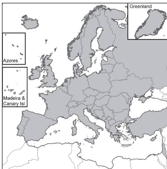
Fig. 1.1 The geographic regions encompassed by the DAISIE database (shaded). Data were collated for the European Union as well as Andorra, Iceland, Israel Liechtenstein, Moldova, Monaco, Norway, the European part of Russia, Switzerland, Turkey, Ukraine as well as former Yugoslavian states in the Balkans. Marine lists were referenced to the relevant maritime state and thus include North African and Near East countries

An up-to-date inventory of all alien species known to inhabit Europe is essential to building an early detection and warning system for the Europe's environmental managers. This critical step represented the major activity in DAISIE and involved compiling and peer-reviewing national lists of hundreds of species of fungi, plants, invertebrates, fish, amphibians, reptiles, birds and mammals. Data were collated for all 27 European Union member states, and where these states had significant island regions, data were collated separately for these as well. In addition, data were collated for European states that are not in the European Union such as Andorra, Iceland, Liechtenstein, Moldova, Monaco, Norway, the European part of Russia, Switzerland, Ukraine as well as former Yugoslavian states in the Balkans (Fig. 1.1). Finally, marine lists were referenced to the relevant maritime state and thus to have full coverage of the Mediterranean, marine data were included for North African and Near East countries. For each species, an attempt was made to gather information on native range, date of introduction, habitat, known impacts and population status. Considerable effort was required to ensure synonyms were accounted for accurately and all national lists were independently reviewed by experts.