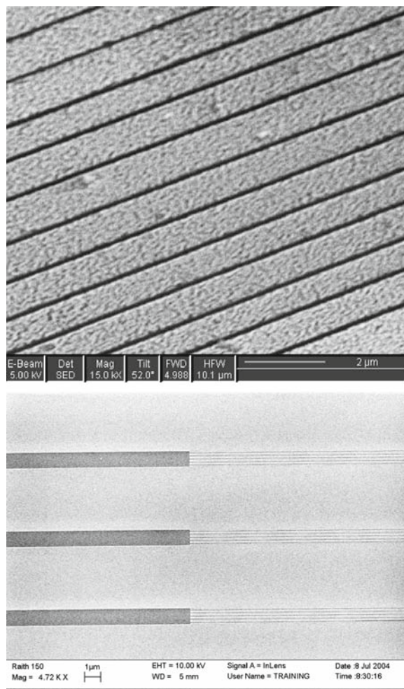
Fig. 2. SEM images of nanofluidic channel arrays at the center of the free-standing \text{Si}_3\text{N}_4 membrane.