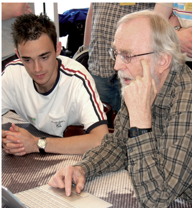
Figure 2.1 Wayne Rasband (right), author of ImageJ, at the 1st ImageJ Conference 2006.

the usual restrictions, ImageJ can be run as a Java “applet” within a Web browser, though it is mostly used as a stand-alone application. It is sometimes also used on the server side in the context of Java-based Web applications (see [3] for details). In summary, the key features of ImageJ are: