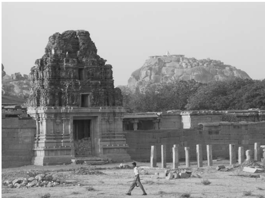
Figure 2-2. Remains of the Vijayanagar empire at Hampi 78

tried to integrate Hindus into his state apparatus. He abolished the pilgrimage tax Hindus had to pay in order to assemble for religious ceremonies; also Hindus were now allowed to renovate their old temples and build new ones. He even formulated a new religion, Deen Ilahi, which combined his favorite parts of all religions he had encountered and studied. His new capital Fatehpur Sikri, close to Agra, is an example of great architecture. However, it was only inhabited for 15 years after which he moved the capital to Lahore to be closer to some insurgence in Afghanistan.