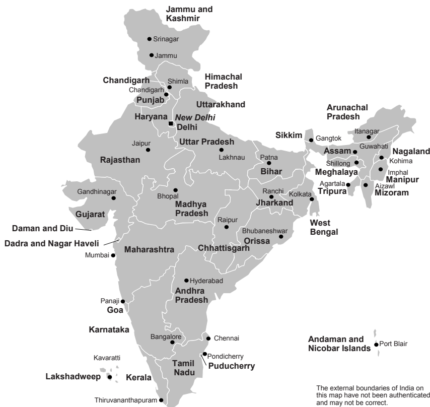
Figure 2-1. The Indian subcontinent

India is rich in minerals; with an estimated 200 billion tons, coal is India's most important natural resource. While there are also some supplies in iron ore, manganese, chrome, magnesium, bauxite, copper, lead, and zinc, India is a net importer for most resources. Crude oil is very rare which poses a big challenge for India's future economic development.