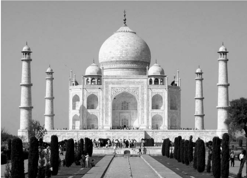
Figure 2-3. Taj Mahal 79

In Rajasthan, the Rajputs remained strong Hindu powers but eventually became vassal states of the Mughal empire. In central India, the Marathas gathered Hindu support under their leader Shivaji. Between 1646 and 1680, he did many heroic acts against the Mughals, was even taken prisoner by the Mughals but managed to escape from Agra Fort again. In the long run, they managed to undermine the Mughal empire by supplying troops and then actually taking control of the land. The expansion of the Marathas to the west was halted by Ahmad Shah Durani from Afghanistan in 1761, but at least they managed to consolidate their power in central India. Nonetheless, they did not manage to hold up against the British imperial power.