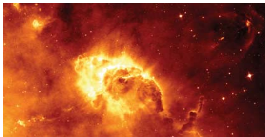
Fig. 2 The HH 666 irradiated jet emerging from dust pillars located southwest of \eta Car. The image was obtained with the ACS camera on the Hubble Space Telescope (see [18]). A color version of this plot can be found in the electronic version of this book and in Appendix A (Fig. A.2)