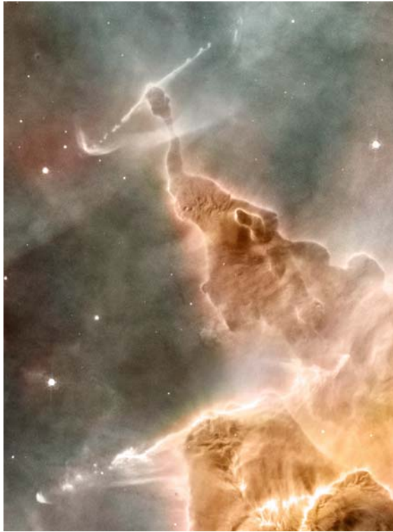
Fig. 1 Irradiated jets in the Carina Nebula illuminated by the Trumpler 14 cluster. A color version of this plot can be found in the electronic version of this book and in Appendix A (Fig. A.1)