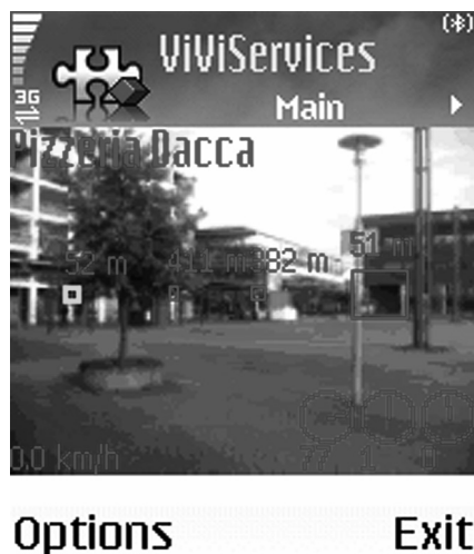
Fig. 2.15 A prototyped Nokia camera phone, equipped with sensors and MARA