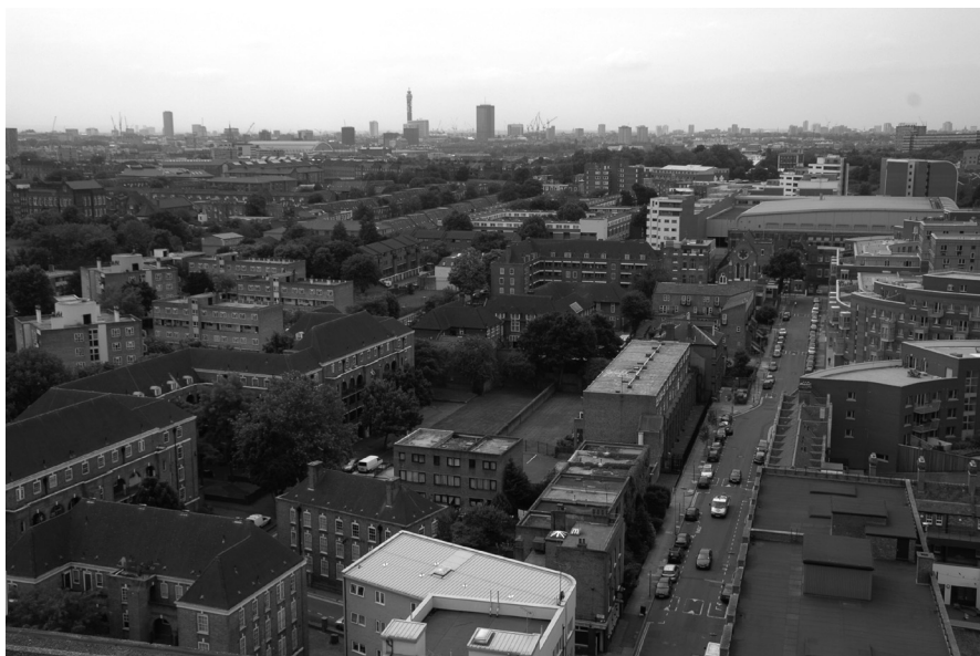
Fig. 2.11 The location of the Urban Education for Trainee Teachers project