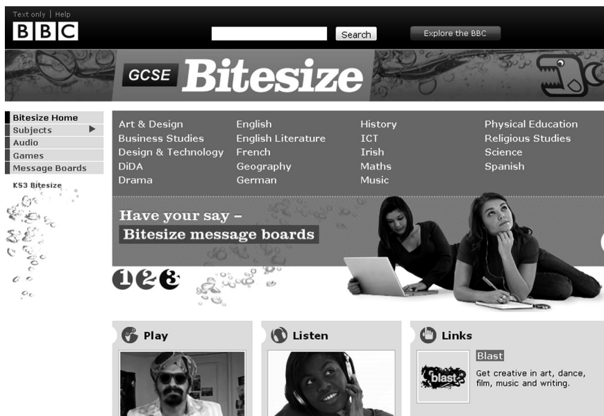
Fig. 2.6 BBC Bitesize (Screenshot taken September 14, 2008)

The BBC Bitesize's ( http://www.bbc.co.uk/schools/gcsebitesize/ ) is a secondary school revision resource for students studying their GCSEs (General Certificate of Secondary Education) in the UK that is made freely available to the world. Figure 2.6 below illustrates some of the features offered by this resource, which includes written content, interactive content, audio, video and games. Sometimes Bitesize allows revision questions to be sent to mobile/cell phones.