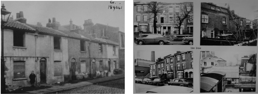
Fig. 2.13 Images from the Urban Education for Trainee Teachers project