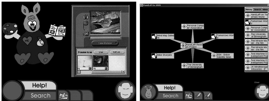
Fig. 2.3 Main screen and concept mapping tool from the HandLeR children's field trip interface (Source: Sharples, Corlett and Westmancott, 2001)