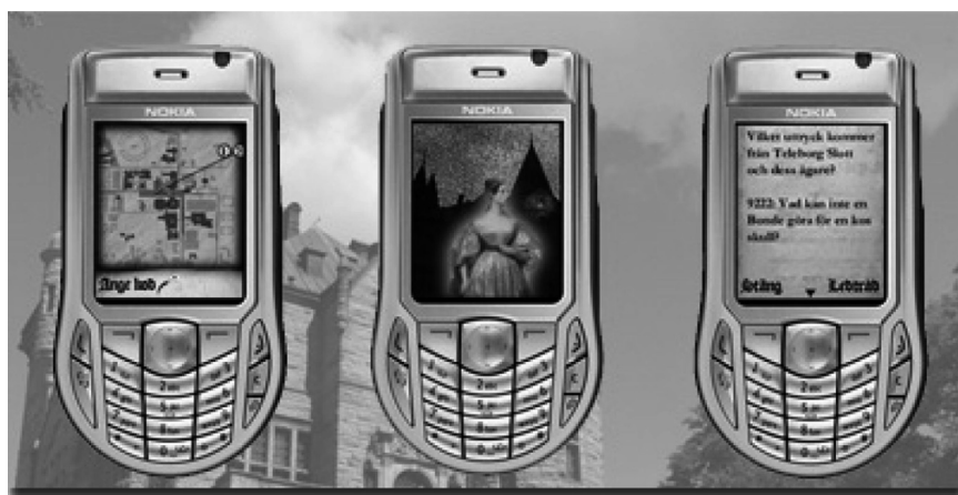
Fig. 2.7 Screen shots from the 'Skattjakt project': the map, the ghost audio clue, and a question screen

The game is inspired by treasure hunts and the sport of orienteering. Up to 6 teams can compete currently. The game starts with a video detailing the mystery of why the ghost of Anna Koskull has come back and now the players need to help her solve the mystery of her late husband Frederick Bonde in order to free her spirit from limbo. After the players get briefed they are split into teams. The game starts and each team gets a different location on the campus to find. The locations are shown on the phone via the Flash Lite Application