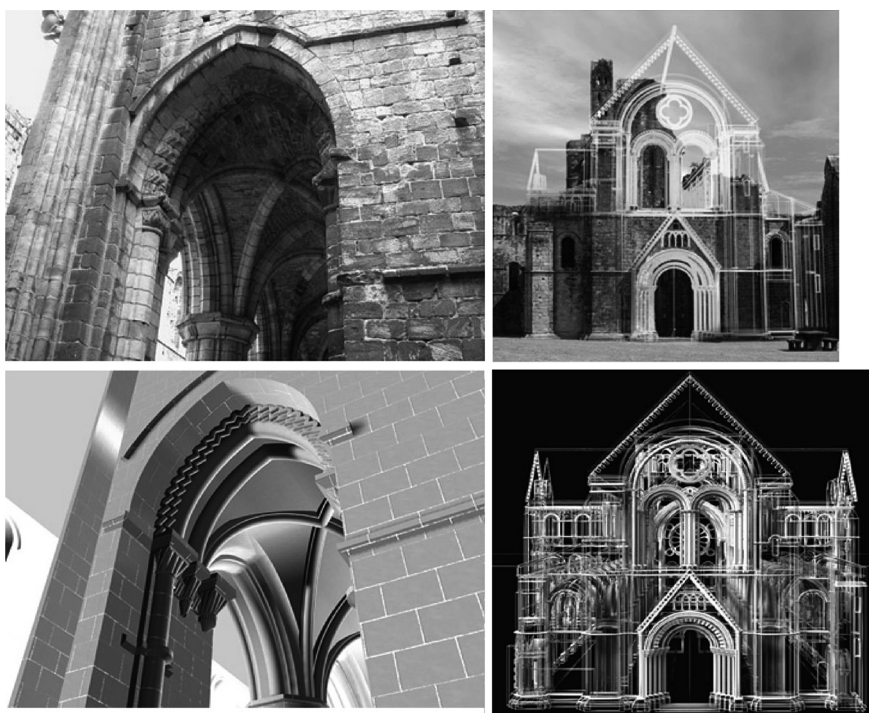
Fig. 2.10 Visualisation in the Cistercian Chapels project

Another approach to mixed-reality is provided by the 'CONTSENS' project ( http://www.ericsson.com/ericsson/corpinfo/programs/using_wireless_technologies_for_context_sensitive_education_and_training/ ), funded by the European Commission's Mobile Learning: A Topography Leonardo Lifelong Learning Programme. The two year project, which started in April 2008, involves a European-wide consortium headed by Ericsson Education Ireland, with Giunti Labs, London Metropolitan University, ECLO (Belgium), Plovdiv University (Bulgaria) and Corvinno (Hungary). The project focuses on the development of appropriate training/learning materials for mobile learning enhanced by context sensitive and location-based delivery. In one work package, based at London Metropolitan University, consortium members are working on new environments and visualisations that are created where the physical and digital interact and inform one another in real time. This Cultural Heritage Learning work package extends work done on an earlier Cistercian Chapels project for archaeology students hosted by Sheffield University, UK, ( http://www.shef.ac.uk/hri/projects/projectpages ). Virtual reality representations of heritage sites can offer innovative solutions to the challenges which exist when learning about our cultural heritage. In order to allow for the greatest degree of flexibility in learning, the outputs of the Cistercian Chapels project are visualised in multiple ways (via multiple media);