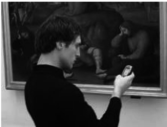
Fig. 2.4 A student with a mobile/cell phone in front of one of Signorelli's paintings in the Leonardo room

system based on results from 'MOBilearn' that enables context aware learning; this approach is being utilised in the 'CONTSENS' project (see discussion below in Phase 3).