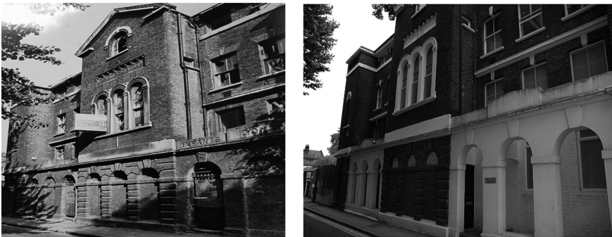
Fig. 2.14 Images from the Urban Education for Trainee Teachers project

Essentially, a learner walks up and uses learning support (e.g. large screens to share information from mobile devices). Such an approach could potentially lead to technology-enabled learning spaces, a theme we will return to in Chapter 14.