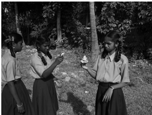
Fig. 2.5 Students using image capture for a science assignment

perceived lack of control over the use of technology in the school. This project highlights a common theme in the literature, that teachers are struggling to keep up with the new modes of technology and digital media appropriation and that this may lead them to take measures to retain control in teaching and learning situations.