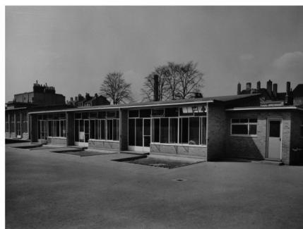
Fig. 2.12 Images from the Urban Education for Trainee Teachers project

and teaching. For example, Rogers et al. (2004) describe approaches to bridging the gap between outdoor fieldtrips and computer-based indoor learning activities with such devices as the PDA pinger