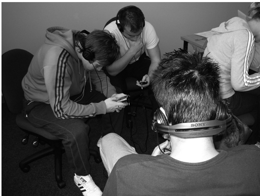
Fig. 2.2 Students evaluating sports science RLOs

available as an internet version). Of particular interest was the observation that the mobile version complimented the web version of the RLO in a number of respects. Firstly, it was observed that having already seen and completed the web-based version, the mobile version could be used to reinforce and memorise what was learnt before an exam 'because, if you were on the train or whatever, to Uni. . . it would be perfect'. Secondly, it was agreed that the addition of audio in the mobile version added to a sense of immersion in the content and an increase in the level of involvement in comparison with the web version. 'It's more like you're in class. . . you are able to concentrate more'. Indeed, Fig. 2.2 illustrates that with headphones on, this form of learning enables immersion in the learning task. The subjects are completely engrossed in their learning activity. A number of students mentioned some other advantages of the mobile version, citing the element of distraction with computer versions: 'Because when I'm on the internet to be honest, I've got loads of different pages open and just flicking through – on the mobile you're just looking at the work' and 'I just think it's much better when you're travelling or whatever, when you're on a train going somewhere. . . If I had it on my phone, I'd look at it definitely'. Students also agreed that they would use the mobile RLO in context, e.g. in the gym to observe muscle mechanics.