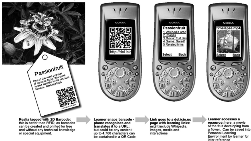
Fig. 2.9 QR codes