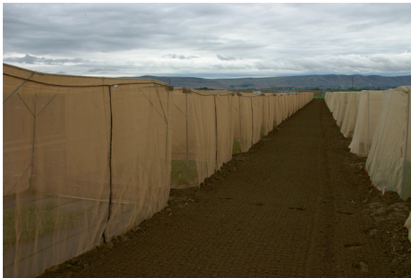
Fig. 3 Series of pollination cages for isolated seed regeneration of alfalfa accessions at Prosser (USA)

Differential seed production among maternal plants, as well as differential pollen production among paternal plants can decrease effective population size ( N_e ), causing population change through drift and selection (Johnson et al. 2002, Van