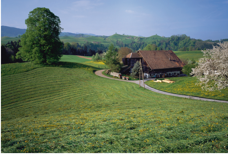
Fig. 2 Permanent grassland of varying intensity of management provides opportunities for in situ conservation in grassland-dominated regions such as in Northeastern Switzerland

situ conservation of diverse populations of grassland species. Options to achieve both agricultural and nature conservation objectives in grassland systems were discussed in a similar way by Wilkins and Harvey (1994). The need for financial compensation to farmers for the economic constraints of such systems has been recognized and is implemented in modern agricultural policies, e.g. in the Common Agricultural Policy (CAP) of the European Union. Whether or not such an overall strategy is sufficient to adequately protect in situ conserved PGR remains open to question.