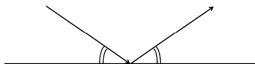
Fig. 1. Path of the beam through a reflection in a mirror

In certain cases, the back-and-forth issue can take the form of a spatial issue. For example, consider the situation when we attempt to identify a beam of light that passes through a reflection in a mirror (Figure 1). If we attempt to predict the path of the beam based on the knowledge that “a beam of light travels along the path that takes the shortest time,” we are unable to evaluate whether or not a path takes the shortest time before the beam has actually travelled.