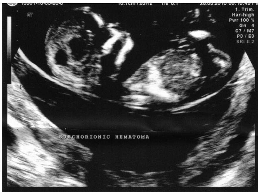
Fig. 2.1 Two-dimensional ultrasonography scan of a subchorionic hematoma in a patient who presented with first trimester vaginal bleeding