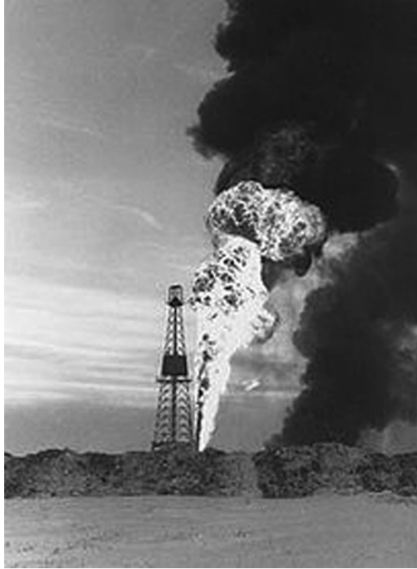
Fig. 2.2 http://en.wikipedia.org/wiki/Leduc_No._1 . GNU Free Documentation License

Alberta's entry into the modern oil industry, but also a metaphor for Alberta's prosperity, our identity as "oil" country. Hariman and Luciates (2007) argue that iconic images represent unspoken civic virtues associated with an historic event. In the Leduc No. 1 image, the dominant reading communicates a message. Devoid of people, it nevertheless makes a strong statement about the role of humans in nature and the character of the men (there were few women) whose ingenuity and hard work have harnessed it. It states in no uncertain terms that human industry can control or bend nature to our economic purposes. And that the business risks and physical perils of oil extraction – taken by those who work in and run the oil industry – are worth the economic gamble (Thompson 1998; Friedel 2008).