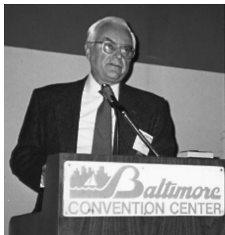
Fig. 2.3 In his rightful role as SETI Elder Statesman, Frank Drake still serves as keynote speaker at SETI conferences all over the world.

This, then, is Project Ozma's legacy: it, and Frank Drake, have turned science fiction into credible, respectable science.