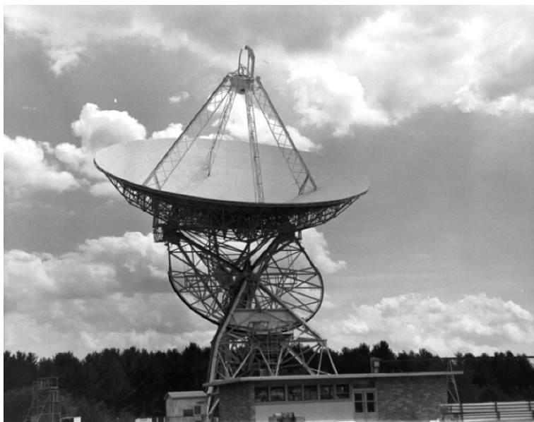
Fig. 2.1 The 85-foot diameter Howard Tatel Telescope at the National Radio Astronomy Observatory, Green Bank WV, used by Frank Drake for his Project Ozma observations in April and May of 1960.

his candidate stars, two nearby sunlike ones which he reasoned were likely to harbor habitable planets. He had selected his research methodology, and proceeded (very quietly) to assemble his listening station.