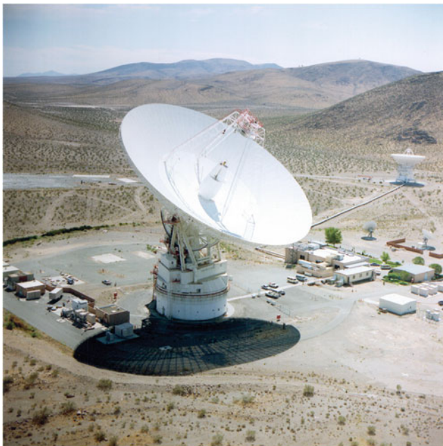
Fig. P.1 Aerial view of Deep Space Network (DSN) at Goldstone, Mojave Desert, Southern California. The giant 70 m dish is in the foreground, a dozen other smaller dishes are located around it spaced up to 10 km's from one another

While the most significant commercial application of linear fiber-optic systems has been the deployment of HFC infrastructure in the 1990s, the earliest field-installed RF fiber-optic transmission system was made operational in the late 1970s/early 1980s at the “Deep Space Network” (DSN) at Goldstone, Mojave Desert in Southern California, just north of Los Angeles. The DSN 4 is a cluster of more than a dozen large antenna dishes, the largest of which measures 70 m in diameter (Fig. P.1).