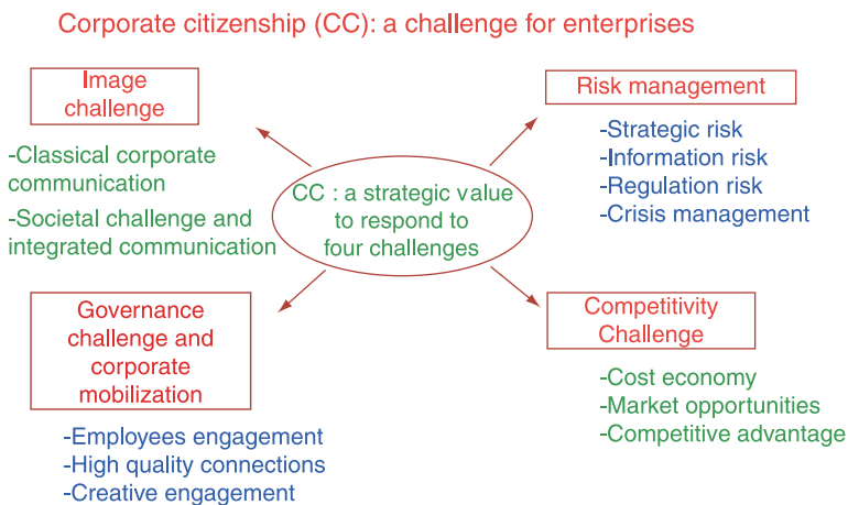
Fig. 2.1 Corporate citizenship: a challenge for enterprises

Four notions outlined in the diagram below form the basis on which CSR is seen as a strategic issue that must inevitably be integrated into corporate global management (Fig. 2.1).