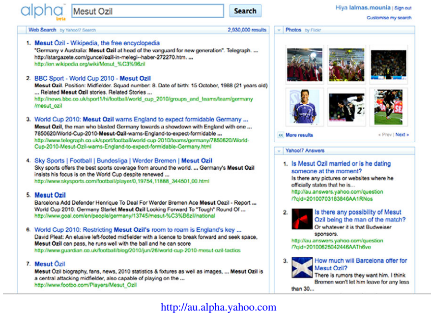
Fig. 5.2 Example of aggregated search (non-blended design)—Yahoo! Alpha

results. For the final composition of the blended result page, a group of vertical results is placed at a slot if the score is higher than some threshold employed to guarantee specific coverage for verticals at each slot. Features used include query log-based features, vertical-based features (provided by the vertical partner), and query string-based features. They show that using pairwise preferences judgements for training increases user interaction with results. This the first work publishing detailed account on how blended result pages are composed.