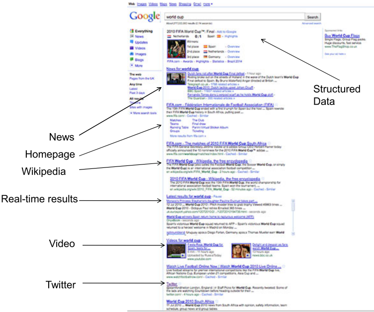
Fig. 5.1 Example of aggregated search (blended design)—Google

The goal behind aggregated search is to remedy the fact, that overall, vertical search is not prevalently used by users. Indeed, JupiterResearch (iProspect 2008) carried out a survey in 2007–2008 that indicates that 35% of users do not use vertical search. This does not mean that users do not have queries with one or more vertical intents. The fact that queries can be answered from various verticals was shown, for instance, in (Arguello et al. 2009), who looked at 25,195 unique queries obtained from a commercial search engine query log. Human editors were instructed to assign between zero and six relevant verticals per query based on their best guess of the user vertical intent. About 26% of queries, mostly navigational, were assigned no relevant vertical and 44% were assigned a single relevant vertical. The rest of the queries were assigned multiple relevant verticals, as they were ambiguous in terms of vertical intent (e.g., the query “hairspray” was assigned the verticals movies, video, and shopping (Arguello et al. 2009)). Query logs from a different commercial search engine analysed in (Liu et al. 2009b) showed that 12.3% of the queries have an image search intent, 8.5% have a video search intent and so on (the total number of analysed queries was 2,153). Similar observations were reached by Sushmita et al. (2010a), who analysed query log click-through in terms of vertical intents. Thus, a vertical search intent is often present within web search queries.