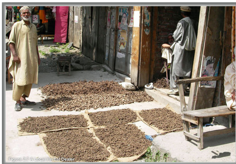
Fig. 2.7 A local herbal dealer

of the dried crude drugs and ultimately causes financial loss to the traders. In order to maintain quality, storage facilities need a definite improvement.