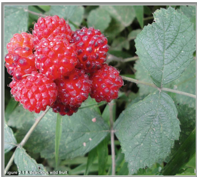
Fig. 2.1 A delicious wild fruit