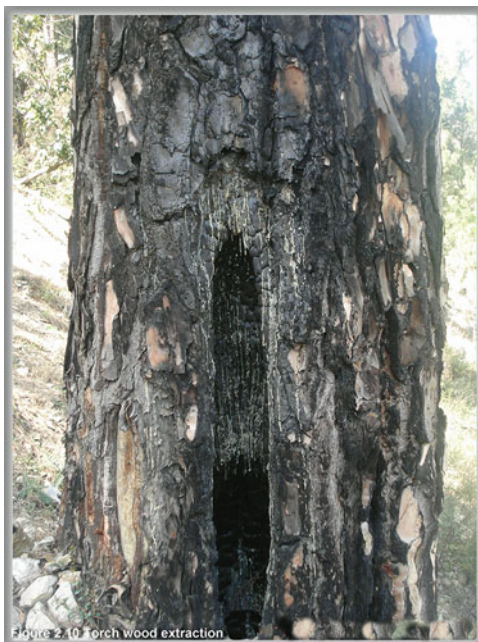
Fig. 2.10 Torch wood extraction