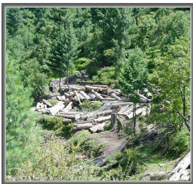
Fig. 2.5 Wood for construction purpose

A proper tool handle is one of the basic requirements for the safety and high productivity of forest workers. Several forest tools have wooden and metallic parts. Substantial amount of work has been done throughout the world to design tool handles, which fulfill the agronomical and physical requirements of the job. In the case of wooden handles, the choice of the species depends upon its strength and other desirable characteristics. Beside strength and elasticity, other properties such as smoothness and the type of splintering that takes place during the failure of a handle are also important [14]. Inhabitants of the area use different plants species in making agricultural implements, ploughs, tools handles, sticks, sickle, dagger, hoe, axe and knife handles. They are made from locally available hard and soft wood. Quercus leuotrichophora , Dalbergia sissoo , Morus spp. Diospyrus lotus , Acacia spp. Juglans regia , Melia azedarach and Olea ferruginea are among the commonly utilized species. The most preferred wood is that of Quercus leuotrichophora , Olea ferruginea , Morus alba , M. nigra , Melia azedarach , Psiticia integririma , Salix tetrasperma , Populus alba , Diospyros lotus , Dalbergia sissoo and Acacia spp. (Fig. 2.5).