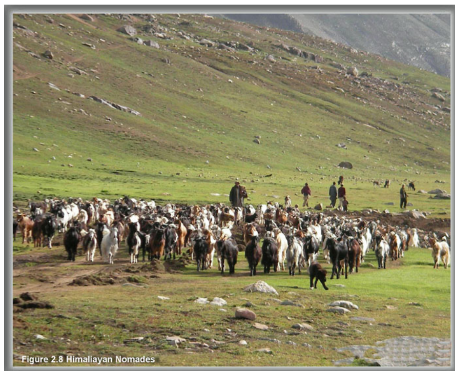
Fig. 2.8 Himalayan nomads