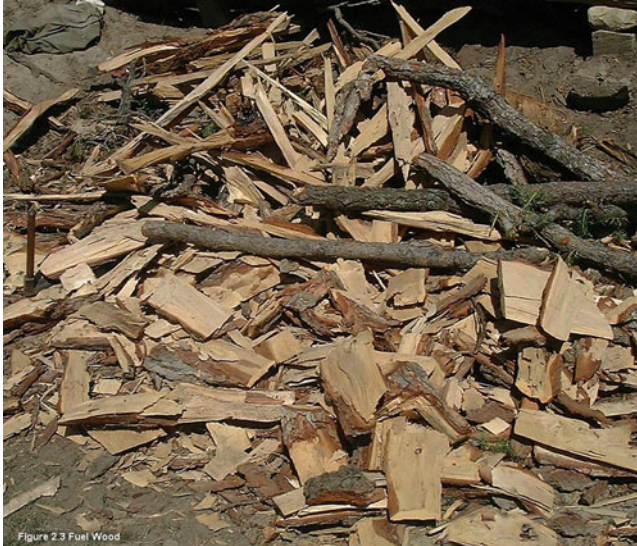
Fig. 2.3 Fuel wood

sacred (shrines, graveyards, and rakhs). Locals pay great homage particularly to the shrines. These intentions of the people can be suggested to use for the protection of reserved areas if the areas near the shrines may be dedicated to the name of the respective saint or shrines by preaching through local religious people. As local inhabitants give more respects to such place and don't exploit vegetation so it is suggested that we can protect vegetation of a place, if we dedicate that place to the name of respective saint or shrines.