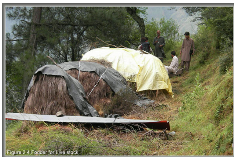
Fig. 2.4 Fodder for live stock

Fodder is the basic demand of cattle. Cattle's fodder requirement is fulfilled in the area because it is rich in fodder species. Local people use trees, shrubs, and herbs as fodder for their livestock. Primarily the members of the family Poaceae are used as fodder in both fresh and dry forms throughout the year. However, Brassica campestris (Sarsoon), Berberis lycium (Sumbal), Celtis caucasica (Batkair), Ficus spp. (Phagwara), Grewia optiva (Dhaman), Melia azedarach (Drek), Morus spp., and Punica granatum (Drauna) are used as fodder in their respective seasons. Grazing is the usual practice for cows, goats, and buffalo. These domestic animals fulfill the dairy requirements of the local people as well as improve the local micro economy. Agricultural areas and "Rakhan" consist of those areas of Guzara forests that have abundant grasses, are harvested in September for the winter, and are regulated as the property of households not cut before September and protected from grazing. Rakhan areas form patches of Guzara forests that are the only source of fodder in winter.