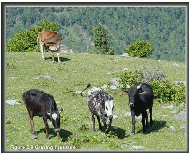
Fig. 2.9 Grazing pressure