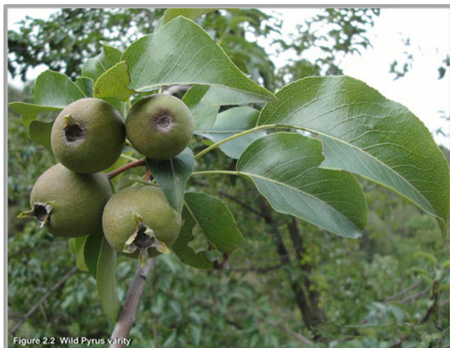
Fig. 2.2 Wild Pyrus variety