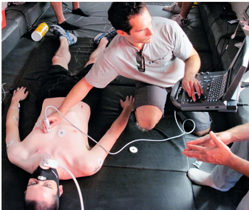
Fig. 2 Research use of echocardiography to determine real-time cardiac function during a CEW exposure to establish human effects