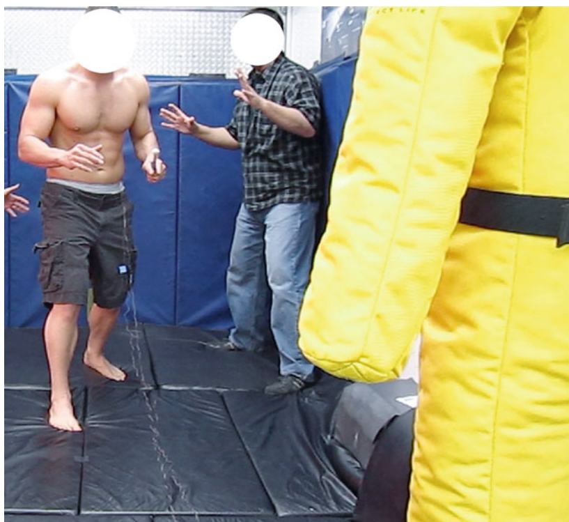
Fig. 3 Research involving a test of motivation during a CEW exposure to establish human effects (test subject attempting to inflict injury upon the yellow “dummy” with a rubber knife)