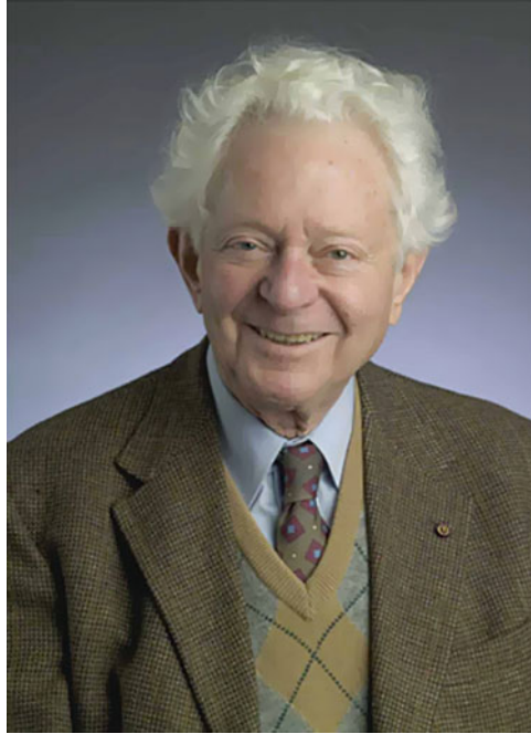
Fig. 1.2 Leon Lederman, Ph.D., Director of Fermilab from 1979 to 1989; recipient of the Nobel Prize for Physics in 1988. In 1986, Dr. Lederman approved Fermilab's collaboration with LLUMC in developing the world's first hospital-based proton treatment center

destruction of the invasive cancer cells growing among normal cells, as had been demonstrated for many years and documented by the worldwide data from using photons (X-rays). By this period, the RBE was known to be very similar for the two kinds of radiation. Loma Linda investigators realized that optimal applications and accumulation of meaningful clinical data could be made only in a facility designed to support patient needs and to operate within a medical environment, with access to a large patient volume and the supporting services available in a medical center. To date, over 15,000 patients have been treated at LLUMC.