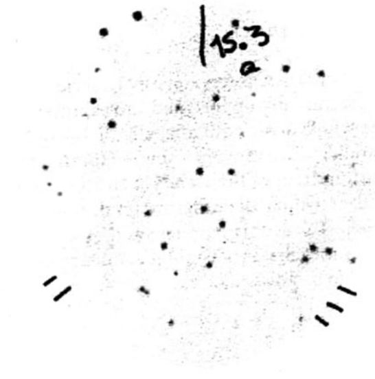
Fig. 1.1 A “colony filter” as used circa 1980 to find genes in clone libraries. Bacterial clones containing human DNA inserts are spread on nutrient agar in a Petri dish (ca 3,000 per dish). After growth of colonies, a nitrocellulose filter is placed on the plate, then removed and treated to lyse the bacteria and denature the DNA. The filter is then incubated with a radioactive probe corresponding to the gene of interest. After exposure to X-ray film, the “positive” clones can be seen and can be picked from the original Petri dish using the orientation marks drawn in radioactive ink

expression of hundreds or thousands of genes, an impressive feat at the time (Nguyen et al. 1995; Zhao et al. 1995) and, together with systematic tag sequencing of cDNA clones as pioneered by Craig Venter (Adams et al. 1991), gave the first general outlook on the human transcriptome as well as on that of a number of model organisms.