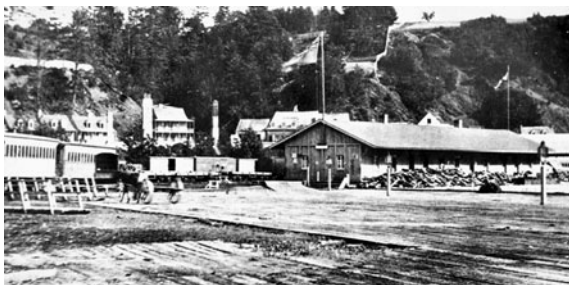
Fig. 2.1 Immigrant shed at Lévis, Québec, c.1860

Given the concurrent jurisdiction, it was important to sort out the jurisdictional issues involving immigration and a Dominion-provincial conference took place on October 30, 1868 to that end. It was at the highest level, with Prime Minister, Sir John A. Macdonald, heading the Dominion delegation. While many decisions were taken with respect to delivery of the immigration program, the only decisions of consequence to the health and care of immigrants was that the Dominion would assume responsibility for the quarantine stations at Québec, Halifax and Saint John and that national immigration legislation would be prepared for Parliament at the earliest possible date. 2