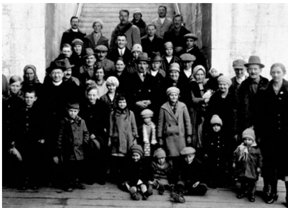
Fig. 2.8 Immigrants at the Canadian National Railway station, Winnipeg, 1920s, Library and Archives Canada , C036148

countries only agricultural workers or domestic servants and those with close relatives in Canada were eligible to immigrate to Canada and the minimum ocean passage was $135. 18