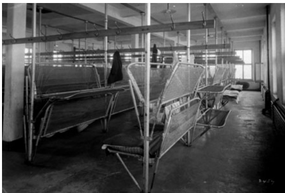
Fig. 2.7 Men's dormitory, Quebec City immigration hall and port of entry c.1911

This approach was reflected in the report of Deputy Minister W. J. Egan in the 1924–1925 Annual Report of the Department of Immigration and Colonization. Egan stated that “Colonization rather than immigration is the most pressing need of the hour and colonization always involves directional effort and after-care; sometimes it necessitates assistance in land purchase ...” The focus was also, increasingly, on immigration “of the right type” 16 and that meant British or American, but not solely. In 1925, the Minister of Immigration and Colonization entered into a joint agreement with both the CPR and the Canadian National Railway (CNR). The “Railways Agreement” authorized the two railways to recruit and select “agriculturalists, agricultural workers and domestic servants” and settle them in Canada with the assistance of the Department of Immigration and Colonization. 17 So, de facto , the two railway companies ran Canada’s immigrant selection system, particularly on the European Continent, and took a large part of the responsibility for settling immigrants in the Canadian west for the rest of the decade.