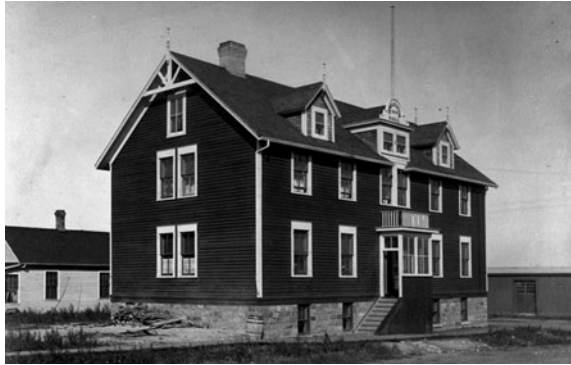
Fig. 2.4 A typical immigration hall, Medicine Hat, Alberta c.1904, Library and Archives Canada , A046342

fit for ordinary farming purposes has been reached, and that now the Canadian Northwest contains the only extensive tract of productive land on the North American continent which is open for free homesteading. Not only, therefore, may the stream of land seekers from the United States be expected to grow, but the current of that class of immigrants from other countries who are looking for farming lands will be turned more distinctly towards this country. 11