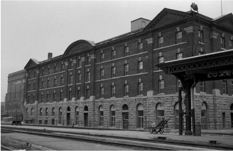
Fig. 2.5 Winnipeg Immigration Hall, No. 1, with CPR tracks in foreground, Archives of Manitoba , Architectural Survey-Winnipeg-Maple St/1 28/69 N21668