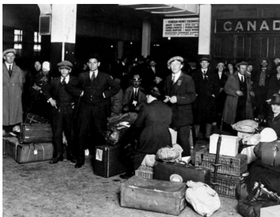
Fig. 2.10 Immigrants arriving at the port of Quebec, c. 1925, Library and Archives Canada , C019935

on only the larger immigration halls. Smaller ones operated in places such as Emerson MB, North Portal SK, West Poplar River SK, Athabaska AB, Edson AB and Spirit River AB (Table 2.1) 20 .