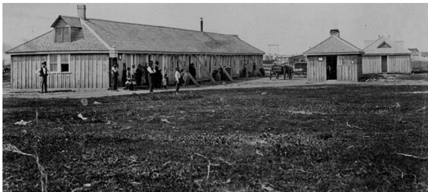
Fig. 2.2 Immigrant shed at the Forks, Winnipeg, Archives of Manitoba , Bole, Elswood 6, N13803

of attracting immigrants to different parts of Canada and finding work or farmsteads for them. The legislation also empowered the societies to extend loans for passage and to sue for recovery of the funds if they were not repaid. It seems that the legislation, which had been championed by the Ottawa Valley Immigration Aid Society, was only used once, in 1901, and languished on the statute book until repealed over a century after it was enacted. Most immigrant aid societies operated outside the authority of the Act without any problem. 6