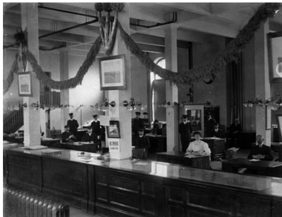
Fig. 2.6 Winnipeg Immigration Hall, No. 1, interior, Library and Archives Canada , C075993

Department of Immigration and Colonization. Though Canada had become an industrialized nation during the war, immigration policy remained focused on bringing in settlers both to open up new land and to take over farms whose owners or their children had moved to Canada's growing cities. However, though their own cities were growing, Canadians watched with a combination of fascination and horror as American cities such as New York and Chicago become infamous for over-crowding, crime and corruption. Canadians and Canadian policy makers assumed that this was due to unchecked immigration to American cities and they were determined to prevent that from happening in Canada. Therefore the focus of recruitment and settlement of immigrants was on the farm.