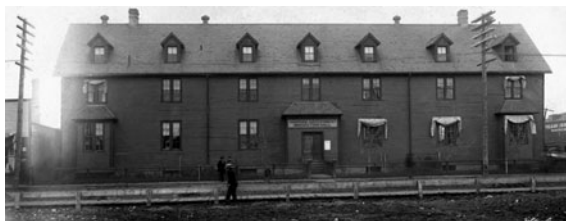
Fig. 2.3 Winnipeg immigration hall, near the Canadian Pacific Railway station, c.1890

immigrants while the newer building was reserved for “British immigrants”. 8 By 1911, the New York Times reported, “There are throughout Western Canada some fifty Immigration Halls ... each a centre of employment and land acquirement information for the new settler, and a comfortable abiding place until he is passed along to his ultimate place of settlement. Beds and bedding are provided for those who must wait overnight ...” 9 Appendix 1 provides more detail on this largely forgotten Canadian initiative Figs. 2.3, 2.4.