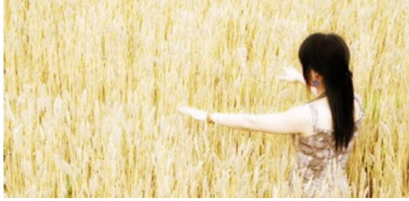
Fig. 2.1 Natural ways to manipulate light