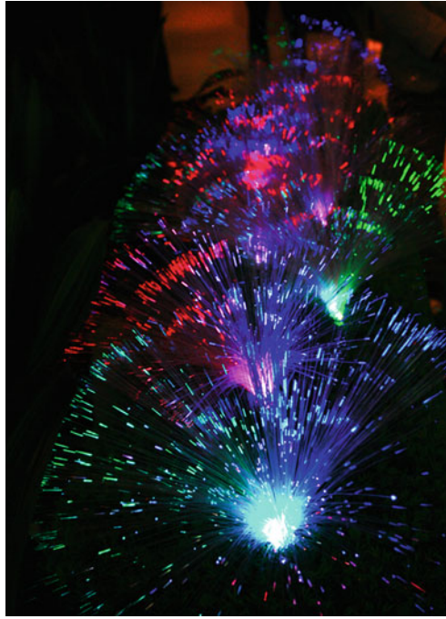
Fig. 2.2 Cornfield Light, during experiment we design many lights in a platform to do exploration