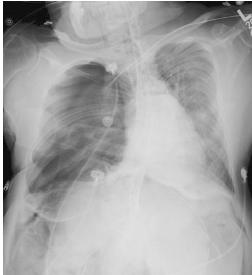
Fig. 2.4 X-ray of a patient presenting kyphoscoliosis.

Kyphosis, also called hunchback, is a common condition of a curvature of the upper (thoracic) spine. It can be either the result of degenerative diseases (such as arthritis), developmental problems, osteoporosis with compression fractures of the vertebrae, and/or trauma. In the sense of a deformity, it is the pathological curving of the spine, where parts of the spinal column lose some or all of their normal profile. This causes a bowing of the back, seen as a slouching back and breathing difficulties. Severe cases can cause great discomfort and even lead to death.