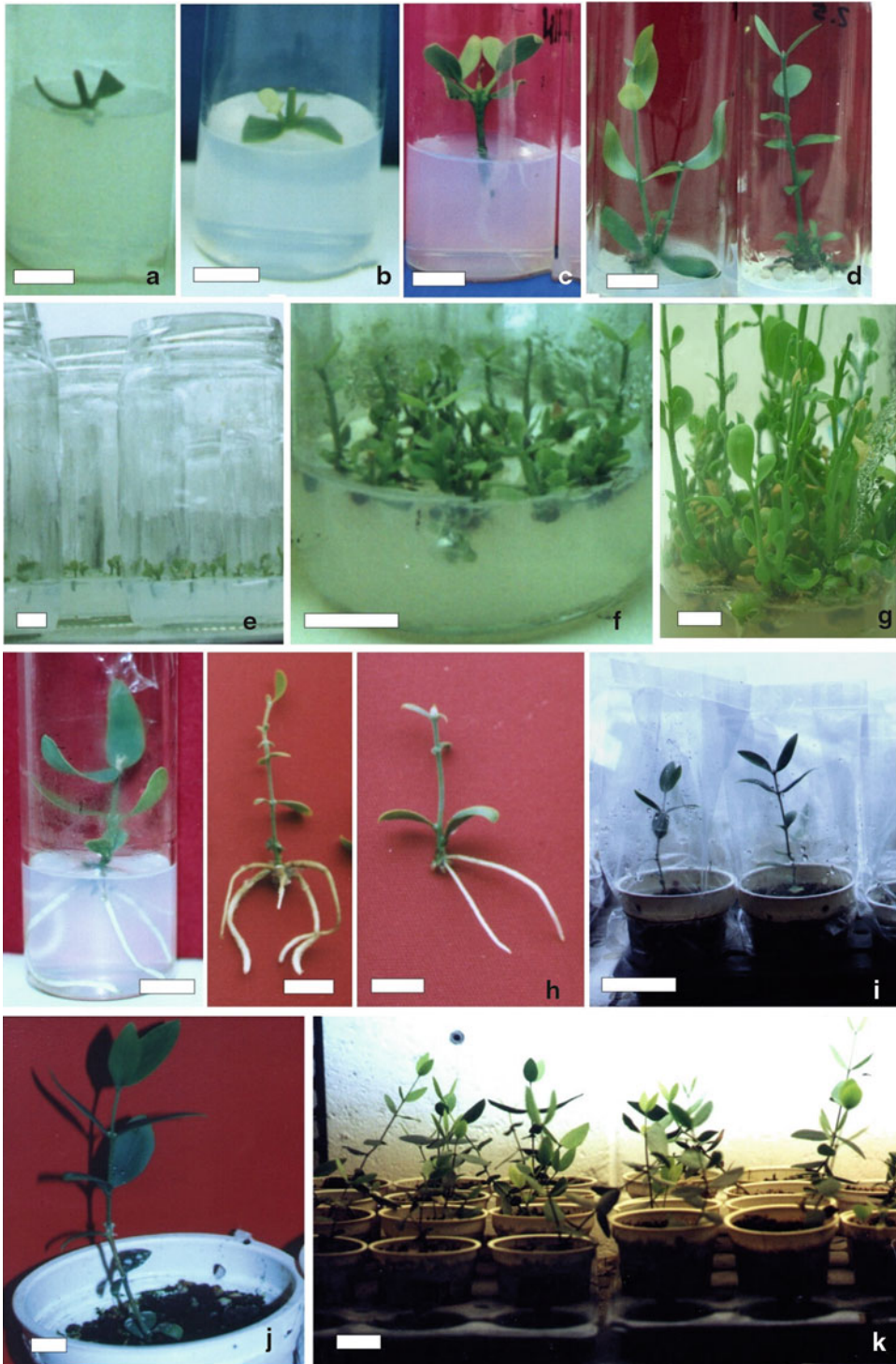
Fig. 1. Jojoba micropropagation. (a–d) Initiation culture; (e–g) Shoot proliferation; (h) In vitro rooting; (i, j) Acclimatization; (k) Micropropagated plants in glasshouse. Bars: a–e, g, h, j: 1 cm; f, i: 2 cm; k: 5 cm.