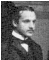
Erhard Schmidt 1876–1959

Earlier, Hilbert regarded a function as given by its Fourier coefficients. These satisfy the condition that \sum_{k=1}^{\infty} a_k^2 is finite. He introduced sequences of real numbers \{x_n\} such that \sum_{n=1}^{\infty} x_n^2 is finite. Riesz and Fischer showed that there is a one-to-one correspondence between square-integrable functions and square-summable sequences of their Fourier coefficients. In 1907 Schmidt and Fréchet showed that a consistent theory could be obtained if the square-summable sequences were regarded as the coordinates of points in an infinite-dimensional space that is a generalization of n -dimensional Euclidean space. Thus functions can be regarded as points of a space , now called a Hilbert space .