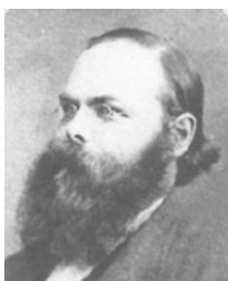
Karl Herman Amandus Schwarz 1843–1921

and Weierstrass. The lecture notes that Schwarz took while attending Weierstrass’s lectures on the integral calculus still exist. Schwarz received an initial appointment at Halle and later appointments in Zurich and Göttingen before being named as Weierstrass’s successor at Berlin in 1892. These later years, filled with students and lectures, were not Schwarz’s most productive, but his early papers assure his place in mathematics history. Schwarz’s favorite tool was geometry, which he soon turned to the study of analysis. He conclusively proved some of Riemann’s results that had been previously (and justifiably) challenged. The primary result in question was the assertion that every simply connected region in the plane could be conformally mapped onto a circular area. From this effort came several well-known results now associated with Schwarz’s name, including the principle of reflection and Schwarz’s lemma. He also worked on surfaces of minimal area, the branch of geometry beloved by all who dabble with soap bubbles.