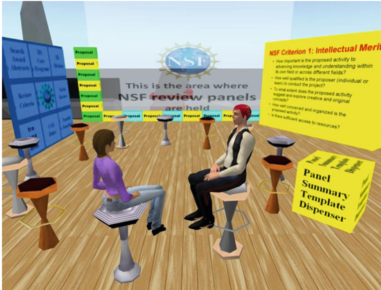
Fig. 2.1 One of the areas where virtual review panels are held by NSF