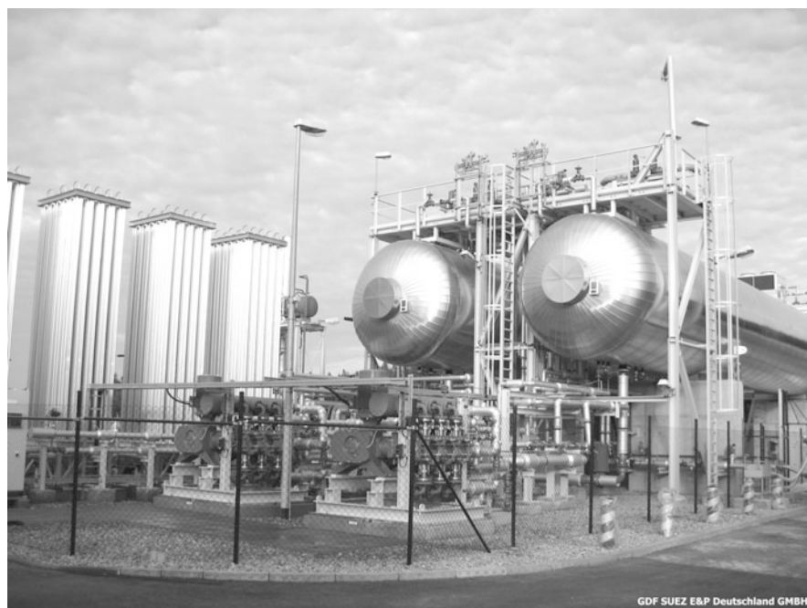
Fig. 2.3 The interim-storage and conditioning unit near Maxdorf (Altmark). In the very front of the two 300 m 3 vessels, two injection pumps are installed. Four air cooled evaporators can be seen to the left hand side

for Geosciences. Besides saline aquifers in the North German Basin (Gerling et al. 2009), the Altmark, as the only almost depleted giant onshore gas field with an assumed storage potential of approximately 500 million tons of CO 2 (May et al. 2003), attracted attention from researchers as well as the power generating industry.