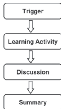
Fig. 2.2 Active-learning-based teaching model

One of the main objectives of introducing a new topic using a trigger is to train the prospective computer science teachers how to face and deal with open-ended and unfamiliar situations. Such situations, which are so predominant in teaching in