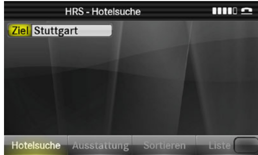
Fig. 2.2 Main screen of the command-based dialog after parameter input