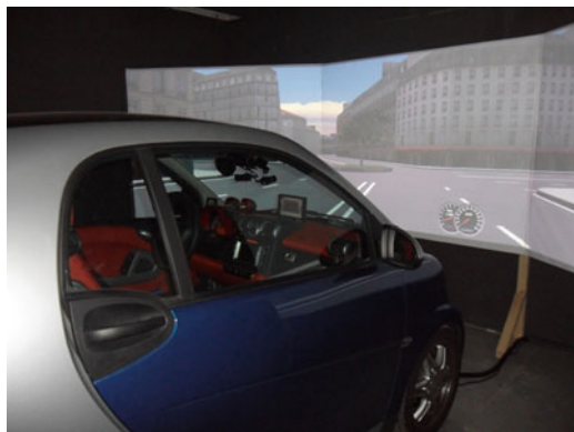
Fig. 2.7 DFKI driving simulator setup

As a primary driving task in the second study, we will use the ConTRe (continuous tracking and reaction) [9] task which complements the de facto standard LCT including higher sensitivity and a more flexible driving task duration without restart interruptions. Another requirement for our evaluation is a more fine-grained assessment of driver distraction, in terms of temporal resolution of performance metrics. In LCT, drivers are only once in a while directed to change the lanes (even with announcement) by conducting a rather unnatural abrupt maneuver, combined with simple lane keeping on a straight road in between. But real driving mostly demands a rather continuous adjustment of steering angle and speed without announcements, when the next demand will occur exactly and to which extend a reaction will be necessary. In order to receive more detailed results about the two diverse dialog strategies, we use a task that rather resembles continuous driving, like a car following task. Furthermore, we prefer an absolute ground truth of perfect