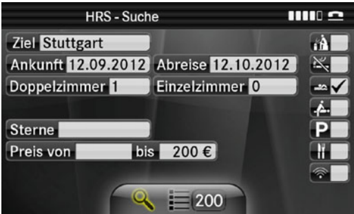
Figure 2.4 shows the main screen at the beginning of the speech interaction. The user is able to input several parameters at once. He is even allowed to already set the hotel facility filters.

After having input all required parameters (and optional parameters or filters) the system calls the HRS service and retrieves a list of hotels (see Fig. 2.5). In this GUI state the driver is able to change the search parameters, change the hotel facility filters, or sort the list by speech. There are no additional screens for presenting the available filters or for the list sorting options. The alterations evoked by speech become only visible on the main screen by changing the information displayed.