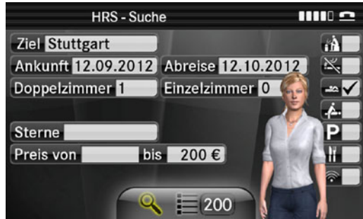
Fig. 2.6 Main screen of the conversational dialog with avatar after parameter input

The symbols on the bottom of the screen resemble the GUI states for parameter input/changes and the result list. The design of the result list screen is the same as the one concerning the command-based strategy.