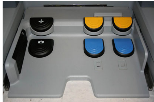
Fig. 2.6 Patient cart

EndoWrist instruments are installed onto the instrument arms after the system is docked to ports that are inserted into the patient. Most instruments offer 7 degrees of freedom and \pm 90 degrees of articulation in the wrist. The arsenal of instruments includes advanced energy instruments (monopolar cautery shears, hooks, spatulas,