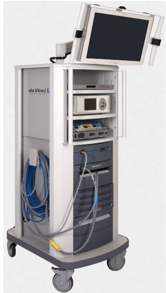
Fig. 2.7 Vision cart

It also provides adjustable shelves for optional ancillary surgical equipment such as insufflators and electrosurgical generators. The da Vinci® Si core on the vision cart is the system’s central connection point where all system, auxiliary equipment, and audiovisual connections are routed. The core also is the “brain” of the system where all computer calculations are processed to control