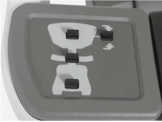
Fig. 2.4 Left-side and right-side pod