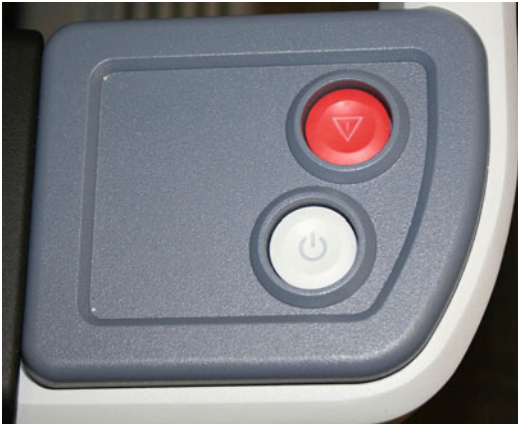
Fig. 2.5 Foot switch panel

master clutch, and arm swap. The four pedals on the right side of the footswitch panel are used for energy activation and are arranged as a left pair of pedals and a right pair of pedals. Cautery, ultrasonic shears, suction/irrigation, and other advanced instrumentation are available for control.