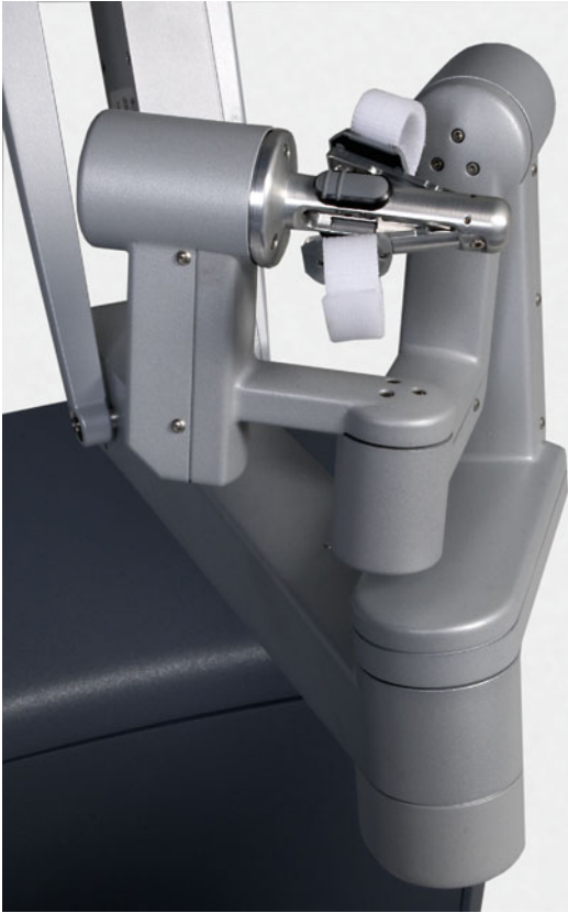
Fig. 2.3 Master controllers

touchpad for preference and feature selection, left-side pod for ergonomic controls, right-side pod for power and emergency stop, and a foot-switch panel for operative mode selection and energy actuation.