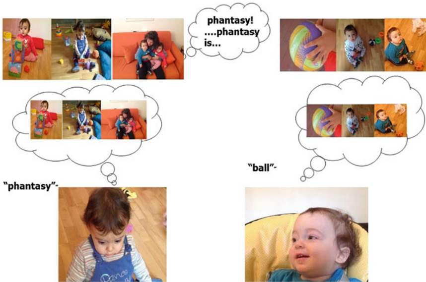
Fig. 2.1 The acquisition modality of concrete versus abstract words. The figure illustrates the tenet on acquisition of the WAT proposal: It shows that in order to learn a concrete concept such as “ball,” the social input is less relevant than in order to learn the abstract concept “phantasy,” which assembles many different experiences and states

than of concrete word meanings for at least two reasons. First, members of ACWs differ more than members of concrete concepts and words—for example, experiences of freedom differ more than experiences of balls—and are often more complex; thus, a unifying label can work as a glue (see Chap. 1 ). Second, due to the fact that they do not have concrete referents, the mediation of language might be more crucial for the acquisition of ACWs than of concrete concepts and words. We will develop this aspect in point 3; in the next chapters, we will present behavioral and neural data in keeping with this hypothesis.