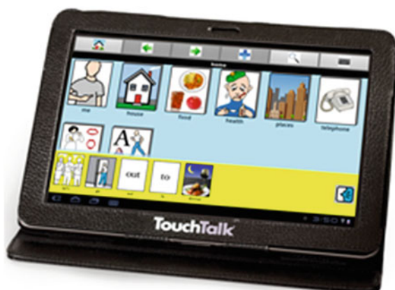
Fig. 2.4 TouchTalk. The TouchTalk is a lightweight tablet-like speech-generating device with a dynamic display. The TouchTalk is produced by Lingraphica®, Princeton, NJ, USA

be able to initiate social interaction through the use of microswitches paired with SGDs. Research is still needed to determine how these social interactions might be maintained through the use of AT.