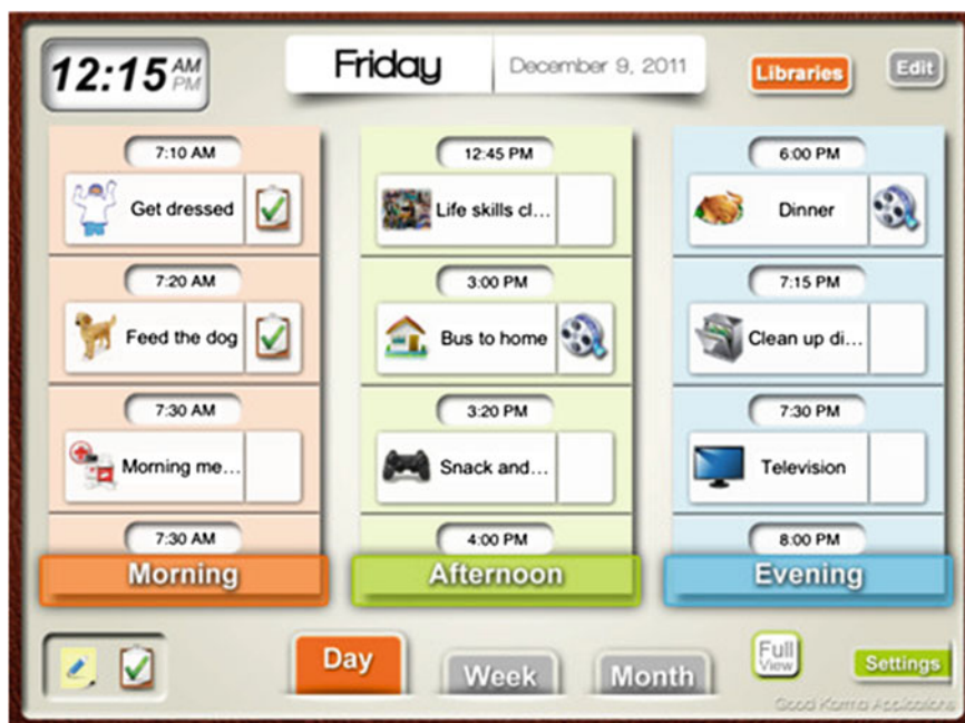
Fig. 2.2 Tablet calendar application. The visual schedule planner is an audio-visual tablet application which allows users to create and manage daily, weekly, and monthly schedules. The visual schedule planner is produced by Good Karma Applications, Inc., San Diego, CA

small portable devices in order to cue, or remind the user to complete specific tasks or attend appointments (Thone-Otto and Walther 2003). Such handheld devices can then deliver reminder messages using a variety of outputs such as voicemail, beeps, alarms, text messages, or visual cues. While the portability and lack of social stigma are benefits of handheld electronic devices, practitioners may find it necessary to program the device with a reminder message in the morning to alert the individual to utilize the device during their day (De Pompei et al. 2008) (Fig. 2.2).