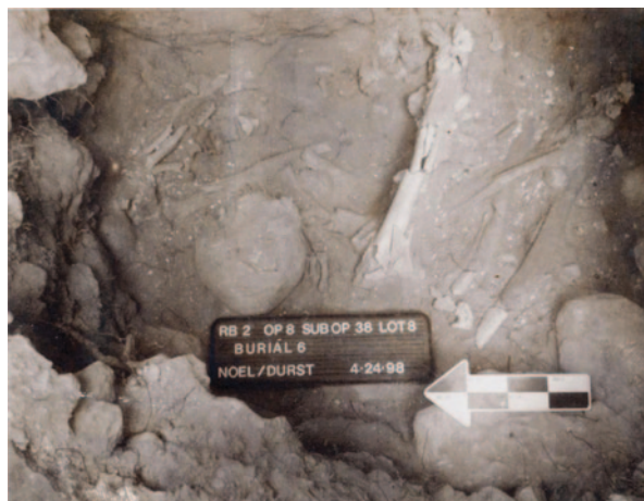
Fig. 2.3 Individual 66 in situ.

19 pieces of mica. Associated architectural features indicate that later occupants of Structure B-16 (like Individual 62) maintained interactions with the biologically dead but socially vital. Namely, a red plaster bench 8 erected atop floor 2 and to the east of Individual 61's body offers evidence of ancestor veneration (Fig. 2.2). Within domiciles throughout the Maya world, benches, amongst other functions, often served as household shrines, and interment of ancestors within or beneath these architectural features was a common occurrence (Geller 2006b; Gillespie 2002; Welsh 1988, p. 188).