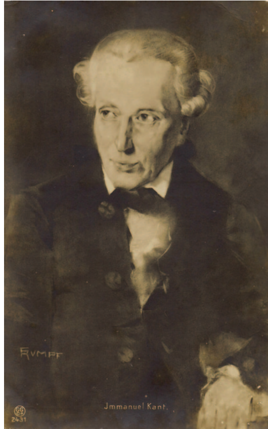
Fig. 2.3 Immanuel Kant, vintage postcard after a painting of Fritz Rumpf. (Born 1856, Frankfurt on the Main; died 1927, Potsdam)

lead one to rethink one's life. Those who have lost relatives or close friends often find themselves in a similar situation. In contrast to this, in normal everyday life, the very limitations of that life are usually pushed to the back of our minds.