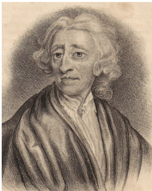
Fig. 2.4 Portrait of John Locke, lithograph, c.1840

(which gives birth to plants as though from nothing), the threat to life by natural disasters , and many more. This subsequently took on a life of its own and became incorporated in symbolism, rites, and concepts (see the discussion of darkness-light dualism or gematria in the following chapters).