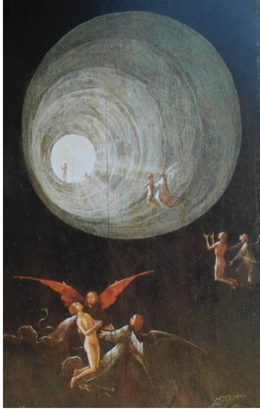
Fig. 2.1 Hieronymus Bosch: "Ascent of the Blessed", oil on wood, detail

after death and which provides all those who suffered from injustice on Earth with transcendental redress, was an important topic of artistic depiction. In this content, it is worth remembering an approach to that same theme in literature, long before Bosch's time, by Dante Alighieri (born 1265 in Florence, died 1321 in Ravenna). Making full use of artistic freedom, he travelled through hell, purgatory, and paradise accompanied by the Roman poet Virgil.