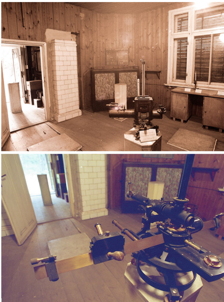
Fig. 1 Some of the modern instruments installed in the 1920s at the newly-built Świder Observatory. Top The Kew magnetometer of the Cambridge Scient. Instr. Co. Bottom The Sartorius magnetometer for magnetic declination measurements.