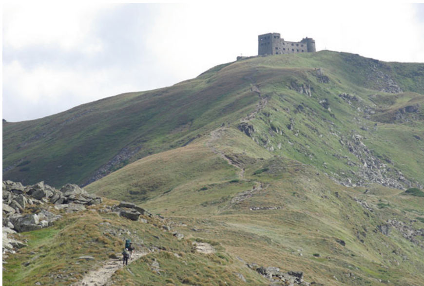
Fig. 2 The former Józef Piłsudski Astronomical-Meteorological Observatory on the Pop Ivan Mount in Czarnohora Mts. Photo by K. P. Teisseyre taken in 2010

leading role was played by the State Meteorological Institute (PIM) in Warsaw, directed then by Jean Lugeon (1898–1976), Swiss engineer and meteorologist. During this expedition, observations in the fields of meteorology, physics of atmosphere and geomagnetism were done; there was also a temporary magnetic station (see e.g., Lugeon 1933). The successful First Polish Polar Expedition (with wintering!) gave an impulse for organizing consecutive expeditions (which came to effect after the Second World War) (Giżejowski 2011).